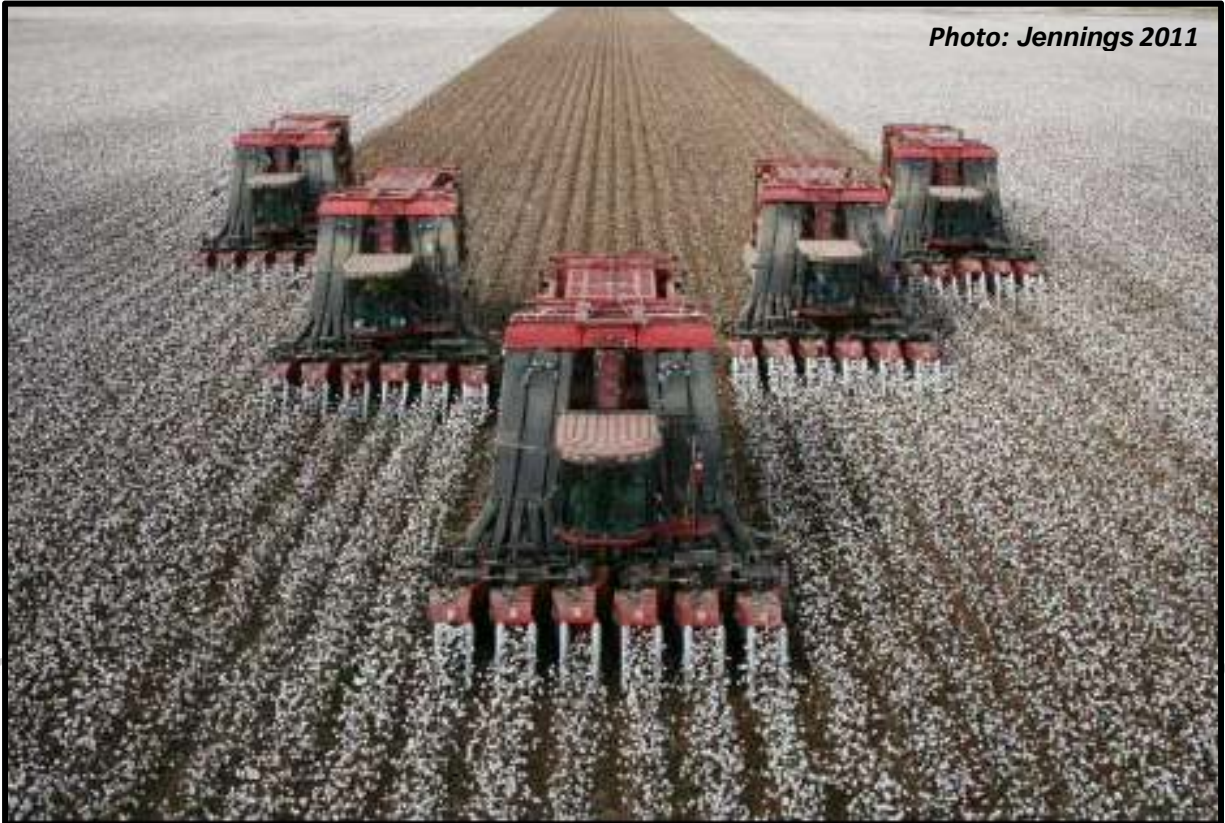
Cliff Heaton Farms